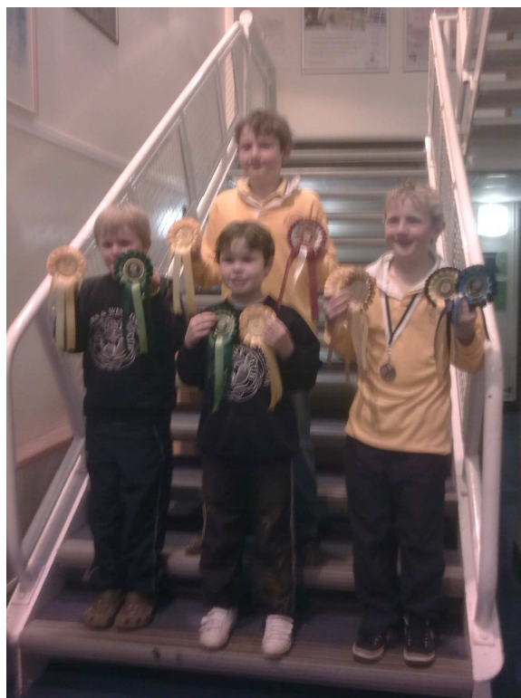
Victorious Spooners Mini Boys 5th March 2011